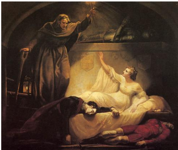
Romeo and Juliet Painting by James Northcote (1746-1831)