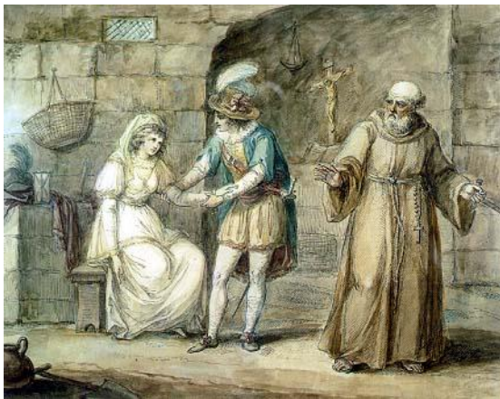
Romeo and Juliet at their wedding, with Friar Lawrence. Painting by Henry William Bunbury (1750-1811)