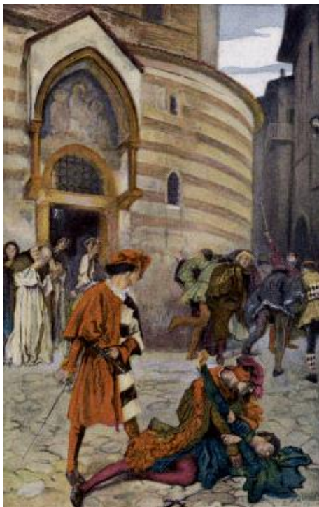
The death of Romeo's friend Mercutio. Painting by Edwin Ausin Abbey (1852-1911)