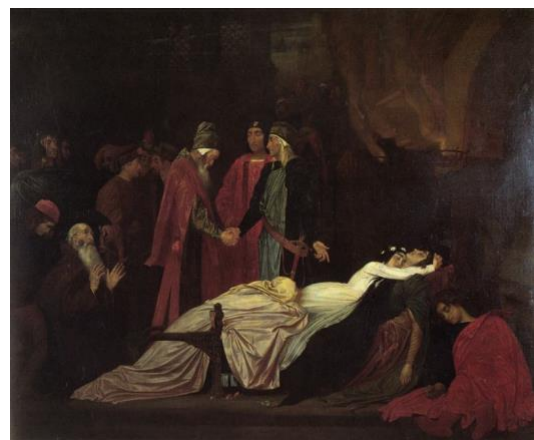
Romeo and Juliet lie dead, the Montagues and Capulets agree to end the fighting. Painting by Frederick Leighton (1830-1896)