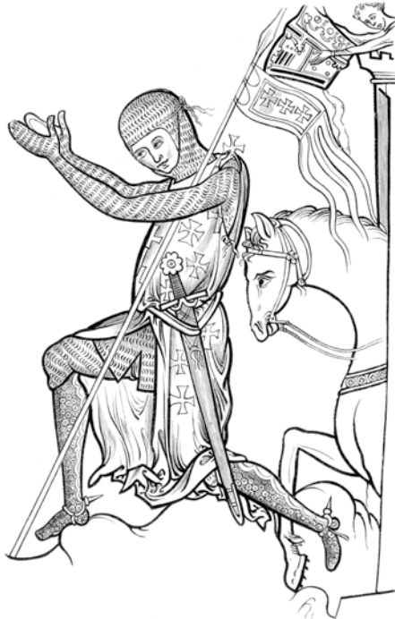
KNIGHT IN ARMOUR. MS. Reg. 2 A. 32.ii. Late Thirteenth Century.

Look at the job advert for a knight, a medieval soldier who fought for the king.