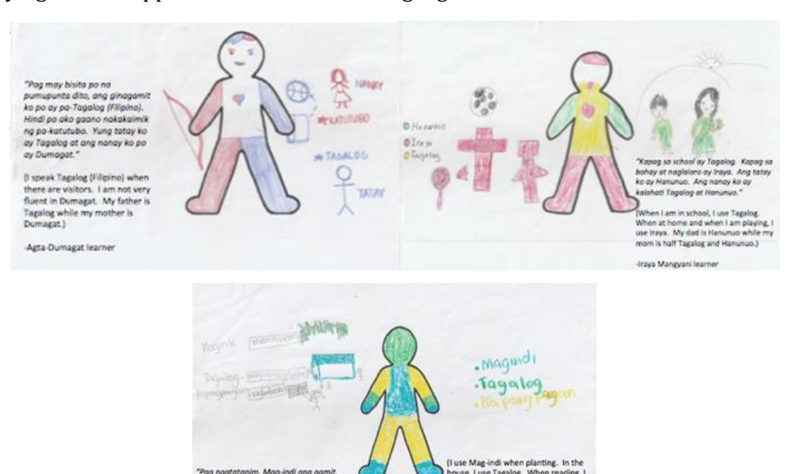
Figure 2. Sample Language Portraits

To illustrate these points further, Figure 2 showcases multicolored language portraits, signifying use and appreciation of different languages.