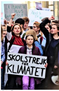
Greta Thunberg in Paris, February 22th

In this episode, Oxford University Press talk to us about a phrase which relates to perhaps the most famous youth climate activist in the world, Greta Thunberg, as we hear about the 'Greta Effect'.