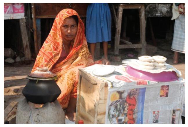
Figure 4: Woman selling rice cakes at the market in Toke

The socio-economic infrastructure of Toke is very limited. Houses are mostly made of clay, straw and bamboo; most of the roads are mud roads, and people usually rely on walking for most journeys. People often use three-wheeler, non-motorised vehicles such as rickshaws for commuting. There are three banks and a few NGOs which operate their businesses in the area. There are eight market places where people buy and sell essential commodities, like fruit, vegetables and fish. Mobile phone servicing centres and computer/internet shops have recently mushroomed in these market places. Market places, and especially their tea-stalls, also provide people an opportunity to meet up and chat with each other (see Figure 4 for a photo taken in Toke Noyon Bazaar).