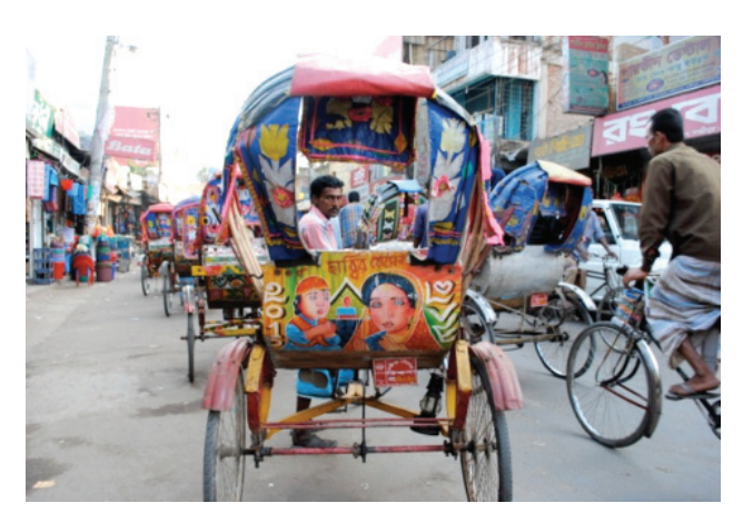
Figure 6: Street view of the road to Shak Char

Shak Char is characterised by underdevelopment, a lack of infrastructure and poor health and sanitation facilities. The only major establishments with a presence there are the Union Parishad Office and a few NGO offices; there are no banks or other financial organisations. The roads are mostly made of mud, and except for some three-wheeler auto-rickshaws there are no public transportation facilities (see Figure 6). Most of the houses are made of coconut leaves, betel nut leaves, bamboo and clay. NGOs such as BRAC, Grameen Bank and Proshika work to eradicate poverty by providing microcredit loans to the local people. Unlike Toke, there are very few mobile phone/computer shops, and people are less exposed to new technologies.