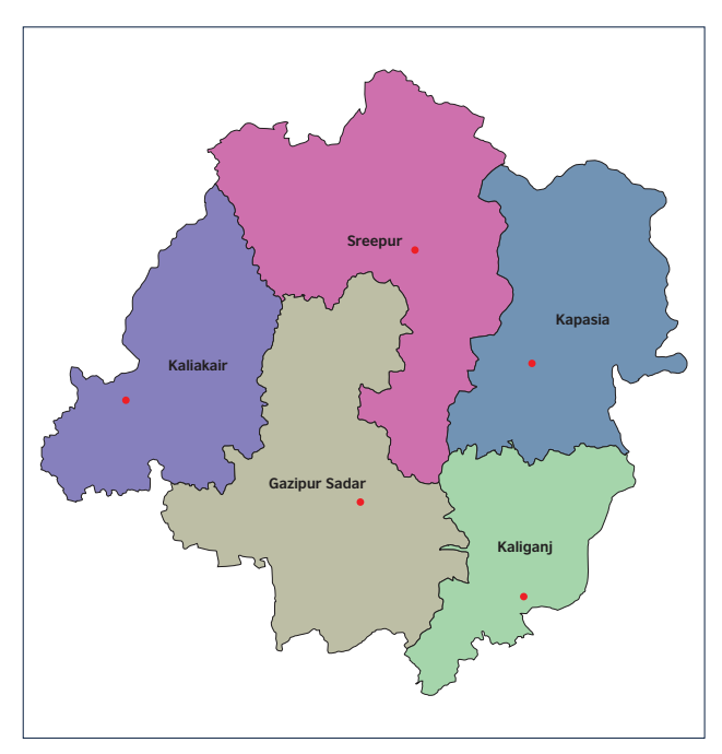
Figure 2: District Map – Gazipur