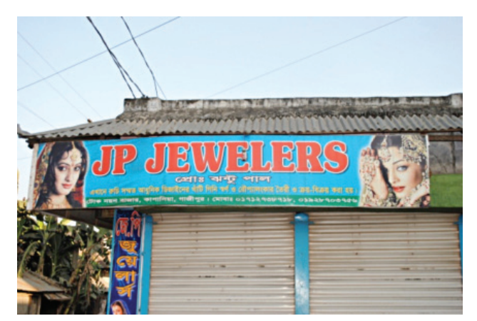
Figure 5: Use of English in shop signs in Toke

The role that English plays in the area at present is limited almost entirely to the academic domain. The main language in Toke is Bangla, and there is no other dominant regional variety. English teachers from different educational institutes offer private tuition at their homes and/or in coaching centres. Everyday discourse is in Bangla except on the few occasions when local people need to talk with foreigners (mostly the donors and officials from NGOs). One can hear some English words being mixed with Bangla in daily conversation, either for the purposes of better communication or to convey symbolic prestige. English words are also used extensively on signage. For example, one can see signs such as 'Renaissance Multimedia School and Coaching Centre', 'A Four Rent-A-Car', 'Ekram Multipurpose Co-operative Society Limited' and so on (see Figure 5 for examples). Children learn Arabic for religious purposes at the Magtabs, which are usually mosque-based Arabic and Islamic religious tuitions centres. Hindu temples similarly offer religious education. Most people understand at least some Hindi, as Hindi programmes from Indian TV channels as well as Bollywood movies are very popular.