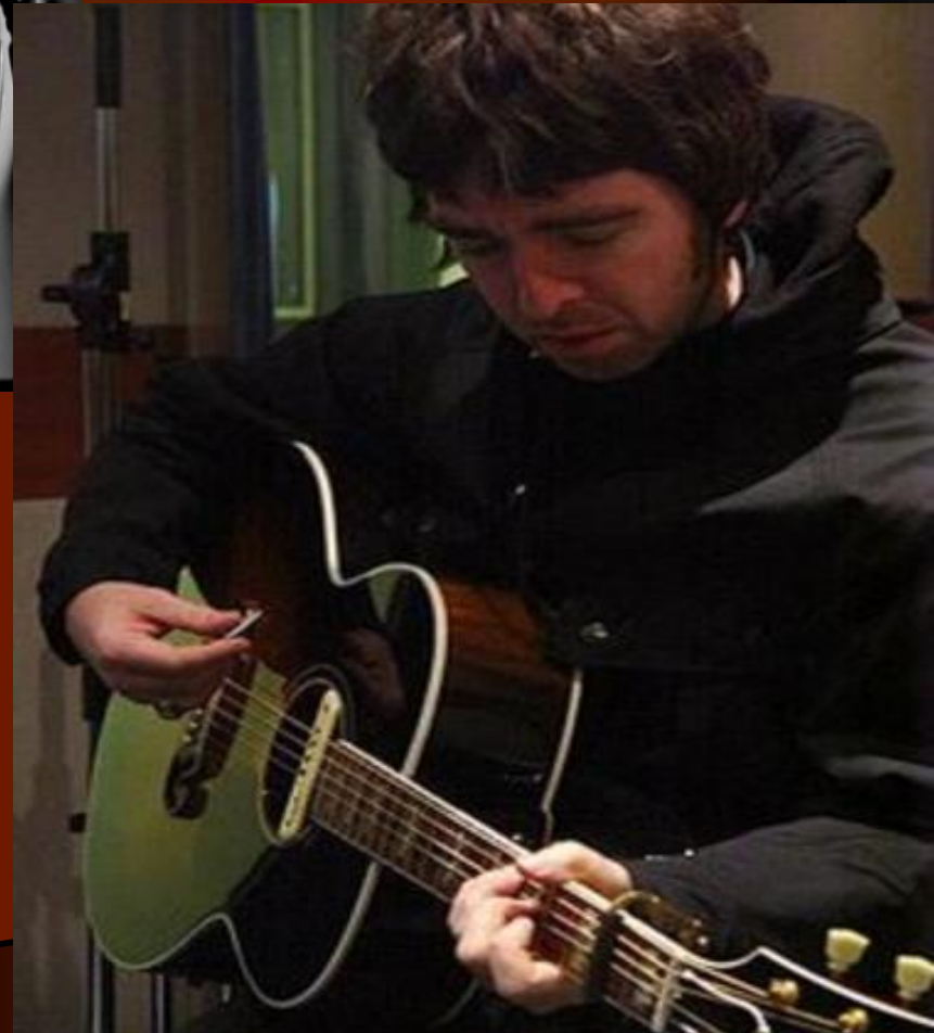
Playing the guitar