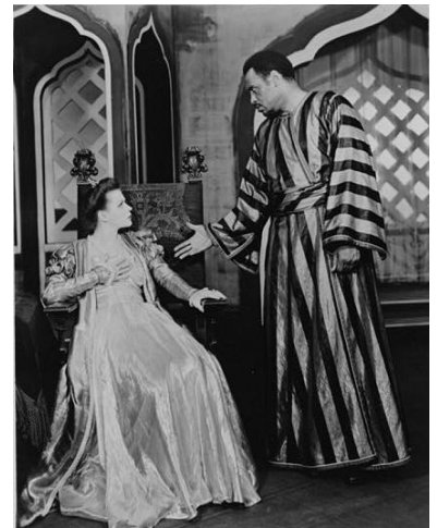
Desdemona and Othello in a 1943 Broadway production of Othello

b. Now decide if you think the predictions in (a) are going to be correct or incorrect.